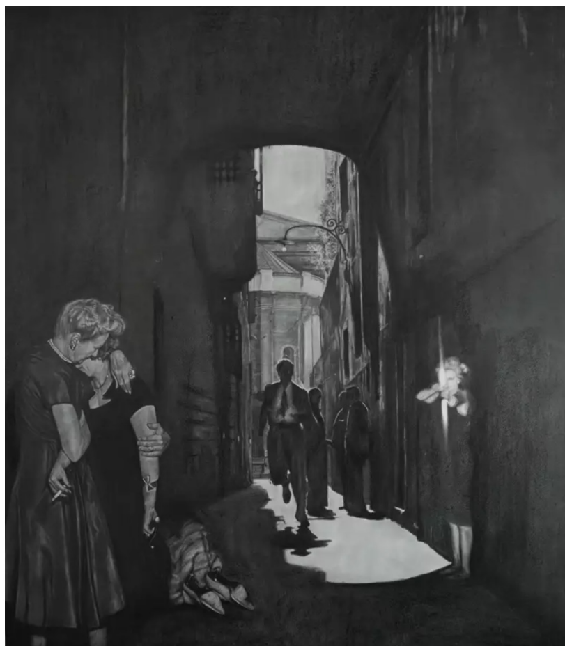
Nina Mae Fowler - I walk alone, Drawing 2022, Pencil and Graphite on Paper, 137 x 120 cm