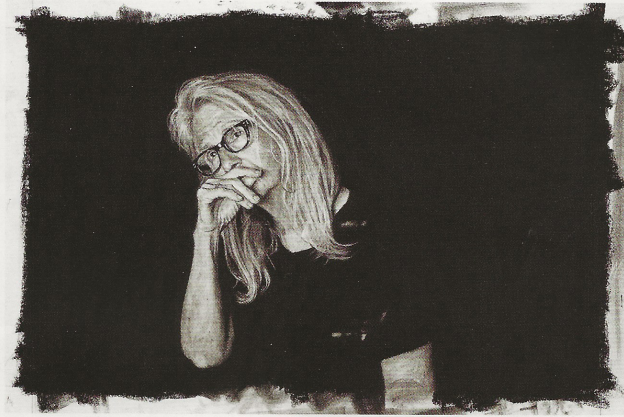
(01:44:48) Sally Potter. "Being watched while watching was an interesting reversal. I often strive for invisibility as a director. I am there to look, not to be looked at. The portrait somehow looks the way I feel - hidden (in this case behind my hand and glasses) but beady-eyed. I recognise myself in a way I rarely do in a photograph."

National Portrait Gallery, St Martin's Place, London WC2H 0HE. Tel: 020 7306 0055. Open daily 10:00-18:00. Friday Lates until 21:00. Admission free. Nearest Tube: Leicester Square or Charing Cross.